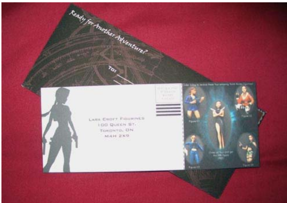
Front side of the insert. It's hard to see but the right side (where the figures are) is a tear-away.