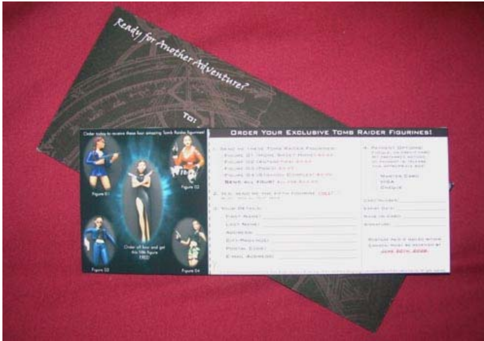
This is the back side of the insert. Here is where they 'order' which figures they want, give their name...etc