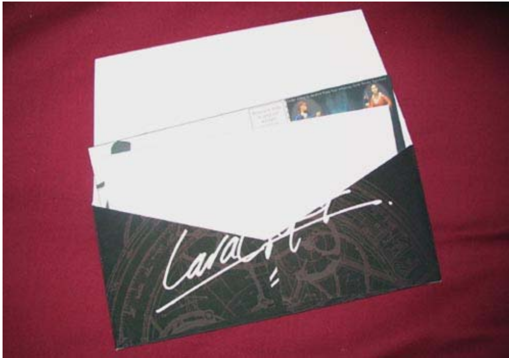
What the envelope looks like when you lift the flap.